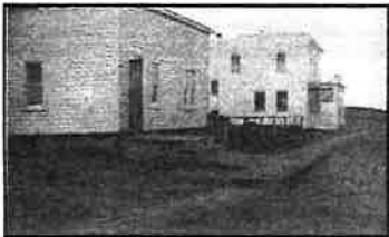
Calmar Post Office Built in 1921 By Postmaster O. Engberg. In background is the Hotel.

Continuing on West, in 1911 the Post Office moved from the Bloomquist homestead to the farm of O. Engberg and then in 1921 a new building was constructed directly west of the hotel next to the vacant lot that you see today. This building was later relocated onto 51 Avenue